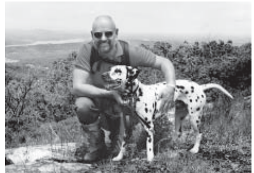
The author enjoys the Wilkinson Trail in warm weather, too.

Descend into Squirrel Hollow, where you may find ATV incursions. If you encounter motorized vehicles, take the license numbers and report them to