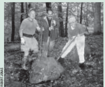
North and West Jersey crews joined forces at Dunnfield Creek.

See website for crew schedule. http://www.nynjtc.org/committees/trailsCouncil/crews/east.html