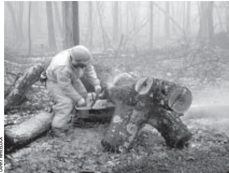
The Trail Conference has a crew of 40 chainsawyers trained to US Forest Service standards.

For some years now the Trail Conference has been coordinating training for those who want to take on this challenge. The US Forest Service has set the standard for the safe use of chainsaws, and the Conference now has 40 people through-