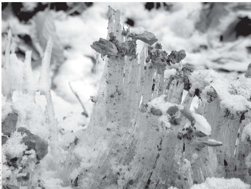
Frozen mud on the trail

woods road. After crossing the second woods road, the trail ascends very steeply through a series of switchbacks.