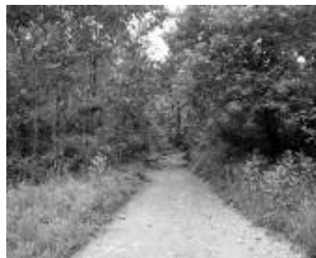
The Shawangunk Ridge Trail follows this now protected rail trail.

Years ago, the northern end of the land was used as a sand and gravel quarry, and there are still remnants of some of the old cement footings and walls. The property has since reverted to a more natural environment.