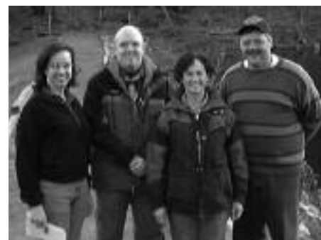
HIKE 'N' SERVE VENTURE CREW #100

Hike 'n' Serve Venture Crew #100, sponsored by the Friends of Glen Gray and with technical support from the Trail Conference, is a Boy Scout division open to young men and women aged 14-20 who have completed the eighth grade. The group, to date composed of dynamic teenagers from Essex, Bergen, and Rockland Counties, pursues outdoor adventure, trail maintenance training, service, and fun. An Adirondack canoe trek is planned for summer 2006.