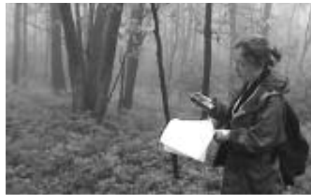
Learn how to track invasive plants that are changing our parklands.

The actual field work will occur during the months of June and/or July when teams of two will be asked to hike a two-mile trail segment while recording the invasive species and documenting the location with the GPS device. Plant identification training will be provided in collaboration with the Brooklyn Botanic Garden using their MetroFlora Database. Volunteers will be trained in the survey protocol, which basically consists of walking slowly along the trail, scanning the woods and noting the presence, identity, and density of any invasive species seen.