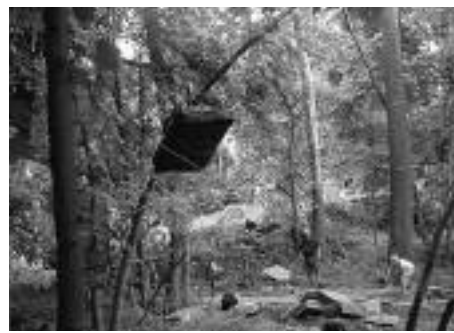
Learn how to fly rocks at Trail U.

Topics covered include: mechanical advantage, simple tools for moving large rocks, safety considerations, proper body mechanics, and methods of reducing natural resource impacts.