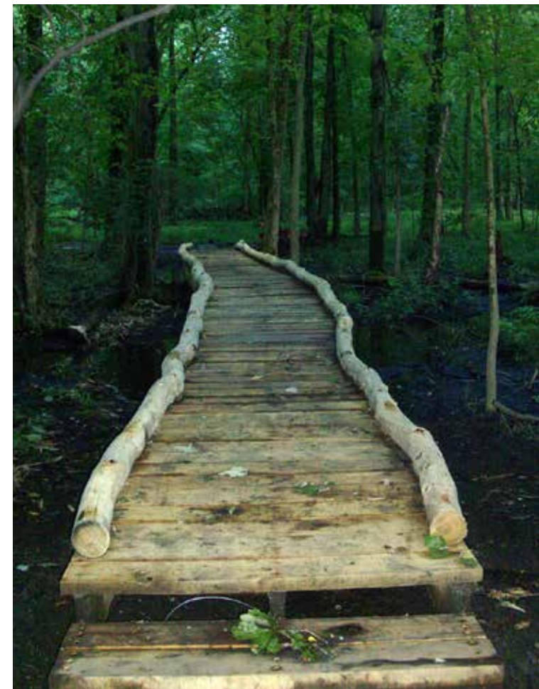
New York-New Jersey Trail Conference

BELOW Puncheon makes muddy trails accessible to people of all ability levels.