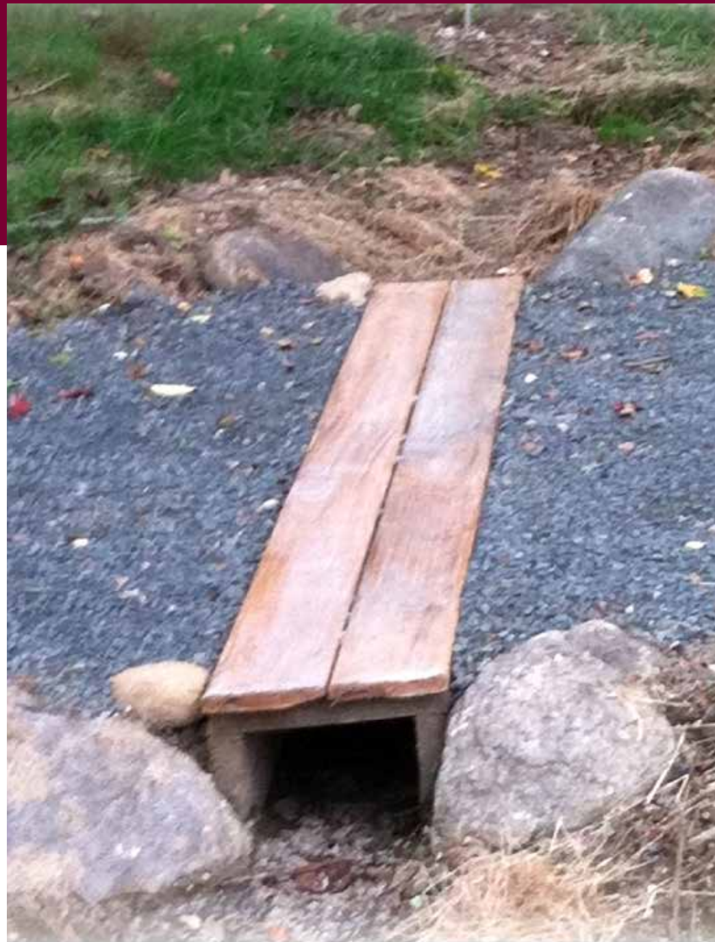
New York-New Jersey Trail Conference

BELOW A common type of closed culvert is a pipe buried beneath the trail, which allows water to flow under the treadway.