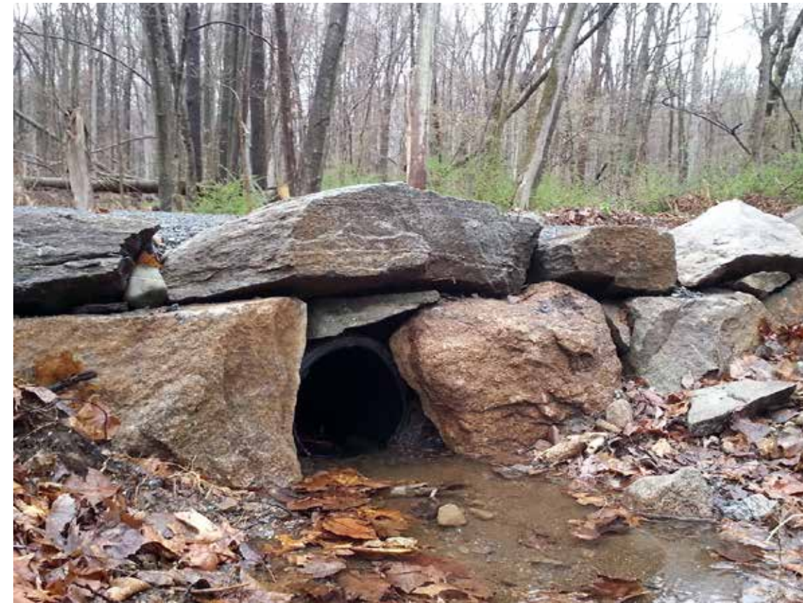
Jay Ericson, Timber & Stone, LLC

BELOW A common type of closed culvert is a pipe buried beneath the trail, which allows water to flow under the treadway.