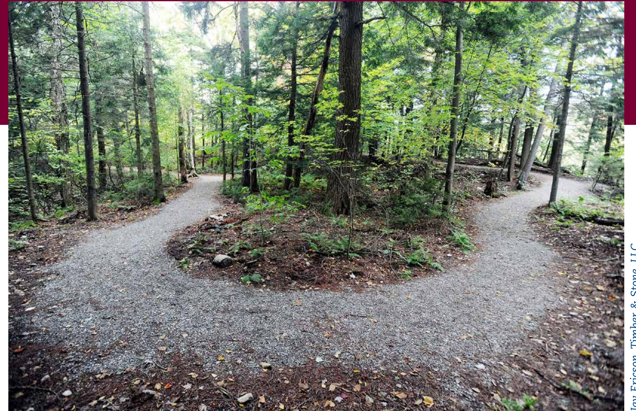
Jay Ericson, Timber & Stone, LLC

Climbing turns are a way to reduce the steepness of a trail. Unlike trails that travel from the bottom of a mountain straight to the top, trails built with climbing turns are less likely to have water get trapped on the path and create a gully. Rather than an abrupt turn, such as a switchback, climbing turns create a large radius that slows down hikers and takes them to beautiful places they might not have seen otherwise. Slower traffic means less displacement of soil from the trail tread and a safer experience, especially on multi-use trails.