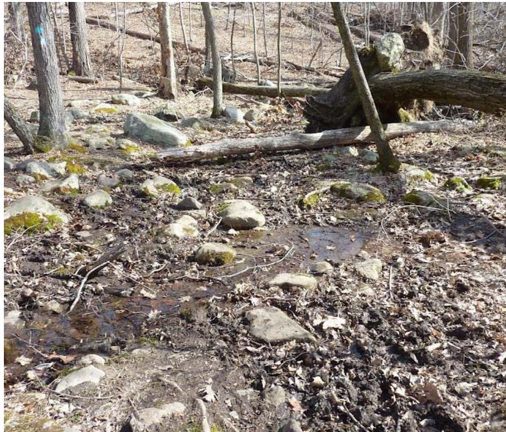
Typical trail conditions now after 5 months of little precipitation

Eroded Deteriorated Gullied Muddy Swampy Uninviting Difficult