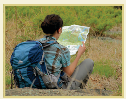
Hiker with Harriman Map Set