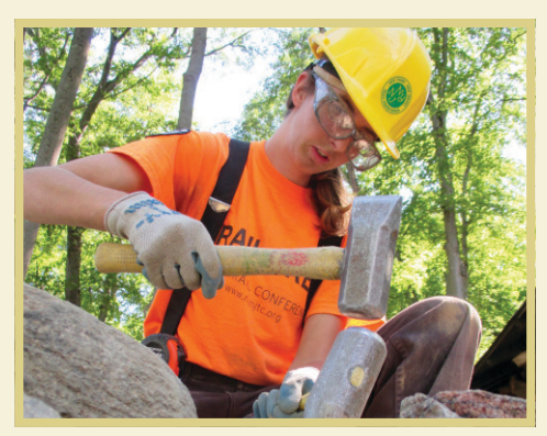
AmeriCorps Crew member on Bear Mountain