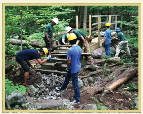
New Jersey Crew at Ramapo Mountain State Forest