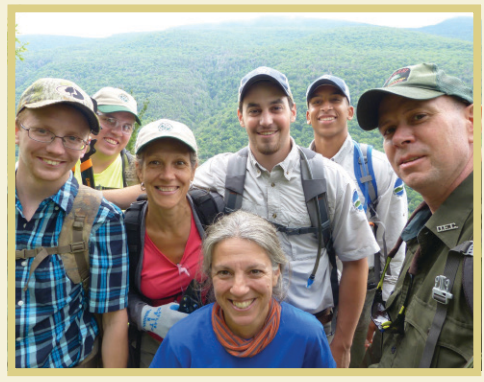
Introduction to Trail Maintenance Workshop in the Catskills