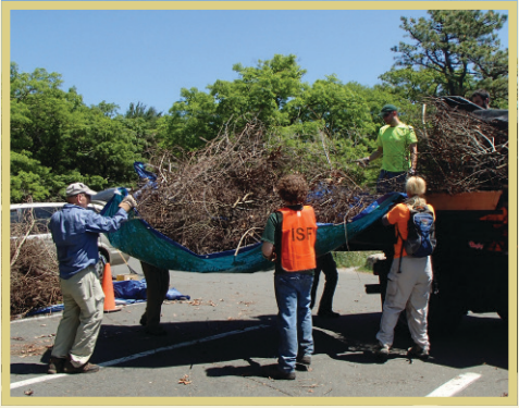
The Invasives Strike Force removes 5 dump trucks full of barberry