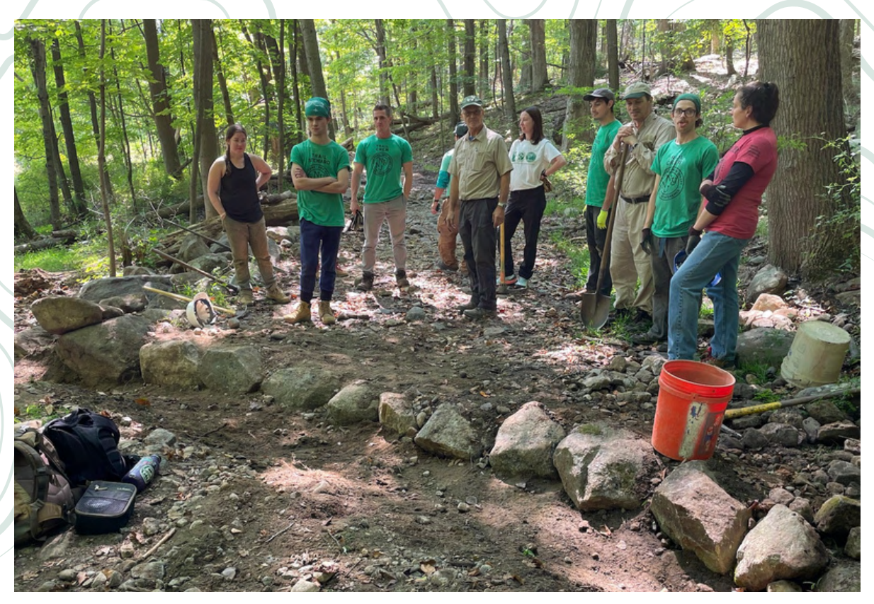
Trail Stewards, Trail Crew, Trail Conference staff, and volunteers admiring their hard work