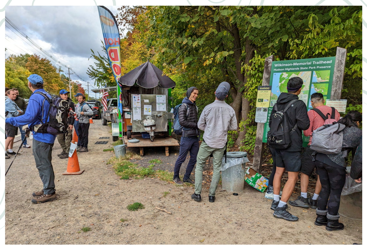
Crowds of hikers gather around the Wilkinson Memorial Trailhead