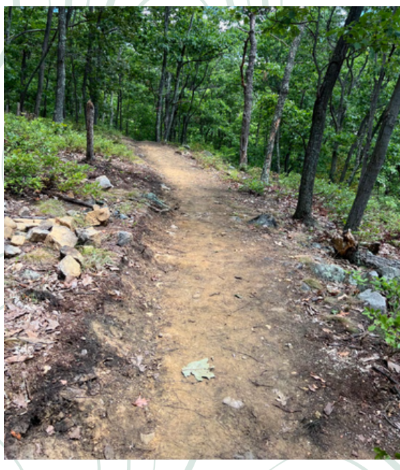
Bench cut section of new trail