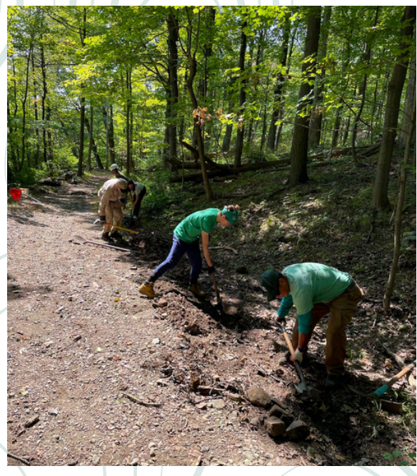
Stewards and volunteers digging a trench