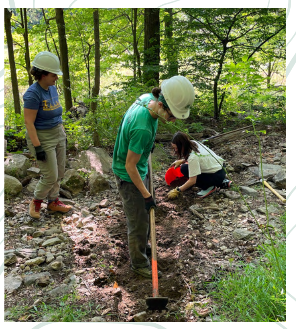
Digging a trench to divert water off the trail