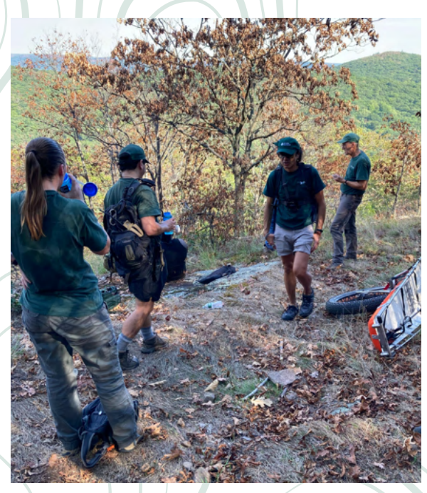
Park staff prepare to escort an injured hiker out