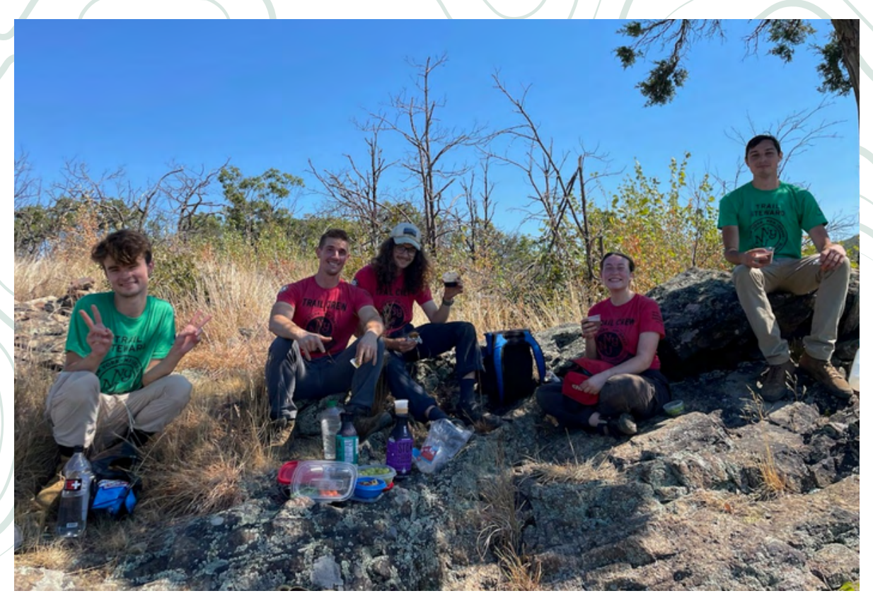
The crews taking a well-deserved lunch break in the shade