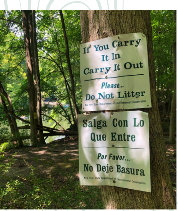
A sign communicating the regulations

Ryan picking up trash along the riverside