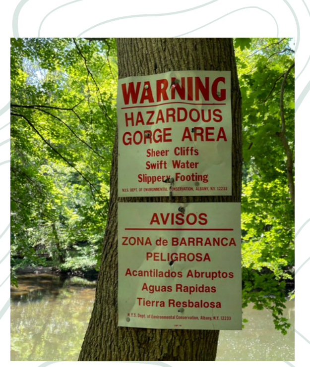
A sign warning of some of the hazards