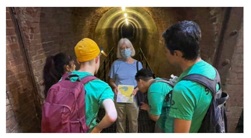
Visiting the Aqueduct Weir in Ossining

When visitors arrived hoping to visit the riverside, the Trail Stewards took time to engage in conversation, asking them what they hoped to do that day, and provided relevant information. In these personalized engagements, there was also the opportunity to discover why people came to this piece of land, what they liked about it, and what incentive they might have to keep it beautiful for future use. The stewards found that most visitors were receptive to the new restrictions and requests to respect the closure to keep the area safe for all to enjoy. Though the Unique Area is not an expansive state park or preserve like our other stewarding locations, the visitors' enthusiasm for the area illustrates the benefits of providing public access to natural lands.