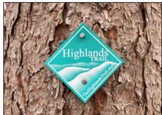
Highlands Trail Blaze

The concept for the Highlands Trail is a connected path linking public open spaces and parks across the region. This is achieved by co-aligning the Trail with existing trails in public parks and establishing new trail connections where required. The complex make-up of the Highlands Trail requires strong partnerships between the Trail Conference and state and local agencies. Managing and maintaining such a trail also involves meticulous attention from a cadre of dedicated