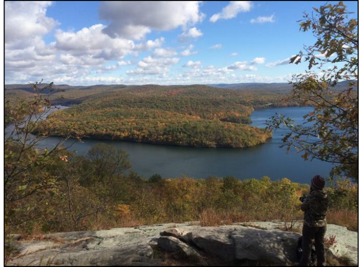
Long Pond Ironworks State Park

The Highlands Trail is a long-distance trail that invites visitors to immerse themselves in the natural beauty and history of the Highlands; a distinct physiographic region made up of parts of Connecticut, New York, New Jersey, and Pennsylvania. The Trail currently spans 180-miles between the Riegelsville Bridge on the Delaware River and Cornwall-on-Hudson on the west side of the Hudson River. It is maintained and managed by the New York-New Jersey Trail Conference , a volunteer-lead nonprofit organization that builds, maintains, and protects public trails throughout the New York Metro Area. Planning is underway to