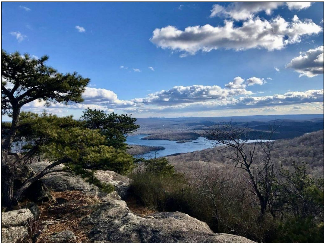
Map: Highlands Trail overview of New Jersey

Twenty years ago, in recognition of this, Congress passed the Highlands Conservation Act in support of the important natural resources and cultural value of the Highlands. The Act determined the boundaries of the four-state region and established funding administered by the U.S. Fish & Wildlife Service to conserve land. In 2022, the Highlands Conservation Act was reauthorized and its objectives expanded to incorporate climate resilience, habitat connectivity, and equitable access to recreation and the outdoors.